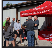
Attendees speaking at vendor booth

Our Elkhart location held a Customer Appreciation event on October 1st. The vendors in attendance spoke with customers