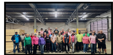
Employees at our truss plant

The employees of the truss plant enjoyed a luncheon in late October. This was to show our gratitude for the hard work that each employees gives in ensuring every task is done safely and efficiently.