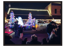
A Big C delivery truck driving in the parade

'Tis the season in Shipshewana! Our employees decorated a flatbed truck with lights and trees to join the annual Shipshewana Light Parade on November 8th.