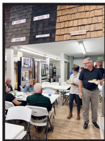
Customers enjoying lunch in Roseland

On October 16th, our Roseland location held a Kitchen & Bath Open House for the public. Customers had the opportunity to enjoy a free lunch and speak with vendors on the newest trends and products in the industry.