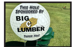
Sponsored hole by Big C Lumber

We had a great time playing at Bent Oak Golf Course on October 1st. This was an event ran by the Builder’s Association of Elkhart County, with Big C Lumber as a sponsor.