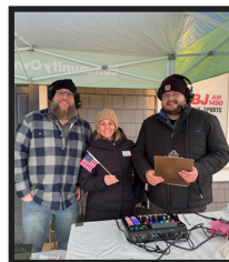
Employees of WLZZ Radio

Our Adrian location partnered with WLEN radio for their annual "Thank a Vet" day on November 11th. This event is to bring awareness to the many challenges