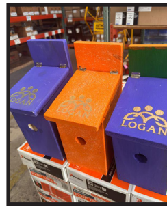
Painted bird boxes

We recently built wooden birdboxes, created by Big C Lumber employees, to the clients of Logan Industries in South Bend. Their clients spent an afternoon decorating the boxes, which they were able to sell at Logan’s annual Holiday Bazaar on November 1st. Thank you to the clients and employees of Logan Industries for inviting us to their facility to make this happen!