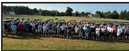
Members of the HBASWM at Lake Michigan Hills

Employees of Big C Lumber attended the Home Builder's Association of Southwestern Michigan golf outing at Lake Michigan Hills on August 13th. Big C was a co-sponsor for the event in partnership with Owens Corning. We look forward to attending next year's outing!