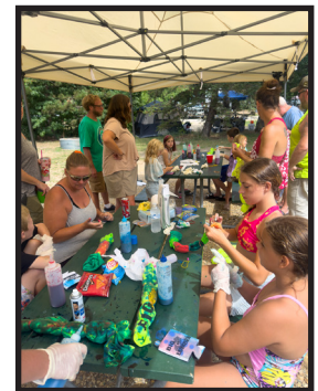
Campers tie dying Big C shirts