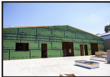
New showroom building in Three Oaks

The remodel of our Three Oaks location is coming along smoothly. Earlier this year we showed the demolition of a storage barn, attached on the backside of the original store. Now, there is a new building constructed which will house our display showroom as well as offices. We plan to have the project finished sometime in 2026.