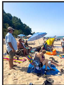
Campers enjoying the beach weather