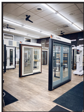
New flooring in Roseland showroom

Our Roseland store recently updated its showroom flooring. It was formally white tile, but now the display area has modern woodgrain vinyl laminate from HappyFeet. This is the second major change to the interior of the store this year, with the first being an updated kitchen and bathroom showroom. The new flooring helps brighten the showroom and create an inviting experience when browsing our product displays.