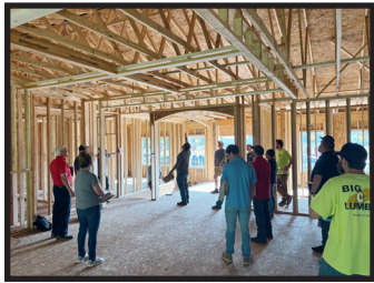
Group inspecting a jobsite