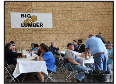
Attendees enjoying lunch in Granger

These events are an exciting opportunity for Big C employees to be able to speak directly with a large group of our customers and show their appreciation for them continuing to do business with us. The vendors in attendance included Palmer Donavin, Owens Corning, Andersen, Woolf Distribution, Milwaukee, and many more. We would like to thank everyone who took the time to attend these events and can't wait to see you all in 2026.