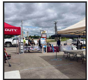
Vendor booths in Schoolcraft