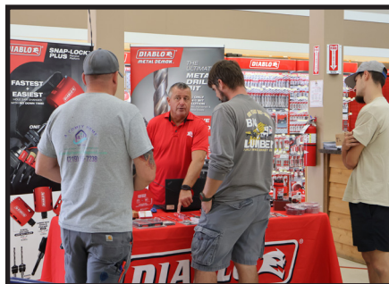
People speaking with Diablo representative in Laporte