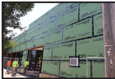
Entrance of Three Oaks location