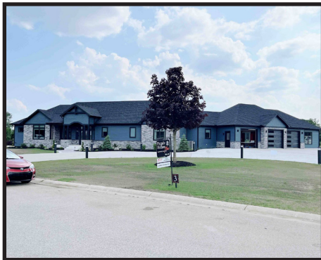
Home showcased by Jeremy's Construction

On June 15th and 16th, the Builders Association of Elkhart County held its annual Parade of Homes event. A total of 17 homes were showcased, with 13 being new construction, 2 currently under construction, and 2 that were remodeled. Jeremy's Construction won 4 awards presented by Surf Internet for Kitchen, Unique Feature, Floor Plan, and Best of Show. Thank