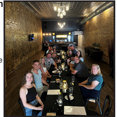
The Shipshewana team celebrating their win at 523 Tap & Grill in Elkhart

Congratulations to all of the Shipshewana team for this amazing accomplishment. We look forward to seeing who will take the title of cleanest store in the spring of 2025!