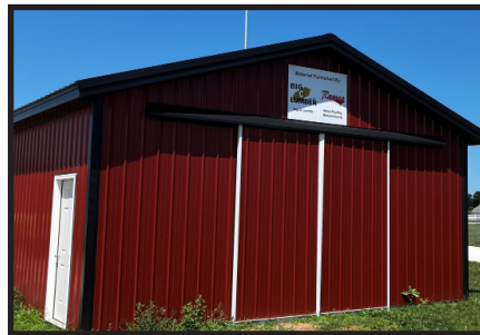
Newly constructed baseball barn

Big C Lumber and Ramco Supply recently contributed materials to build a new shed for the Shipshewana Youth Baseball Program at the fields adjacent to our Shipshewana store.