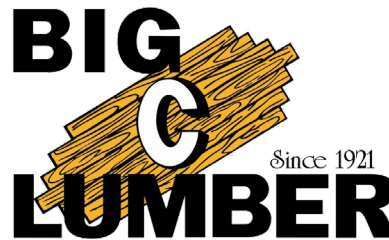
Logo from 1988 - Current