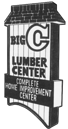
Logo from 1979-1987