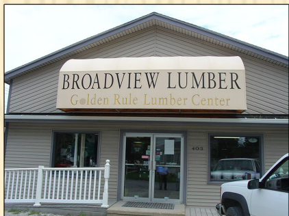
Former Broadview Lumber sign at our Kendallville location.