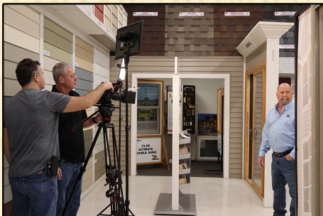
Behind the scenes of new commercial shoot at our Roseland location.