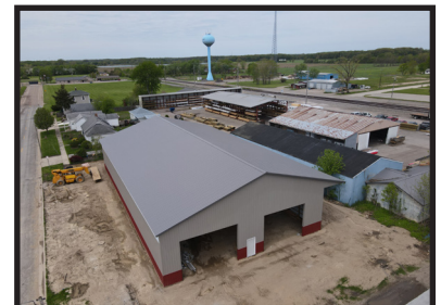
Aerial of new storage barn located on Linden St.

Big changes are coming to our Three Oaks location! Being a busy location means that space can be tight at times, so it was more than necessary to expand. Earlier this year we acquired a lot next to this location to construct a storage barn, and now it has been erected. The improvements don't stop there though; the retail side will also be updated with a new showroom to better showcase our various displays. This is our oldest location with it being brought into the Big C family in 1923.