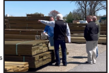
Executive Team inspecting the Granger yard

At face value, upkeep for a location may seem simple. However, the scale of property that each location has to maintain can be intricate at times. This is why we all follow the 6S principles to keep everything orderly (Sort, Straighten, Shine, Standardize, Sustain, and Safety). We appreciate each location keeping their stores safe and clean for all.