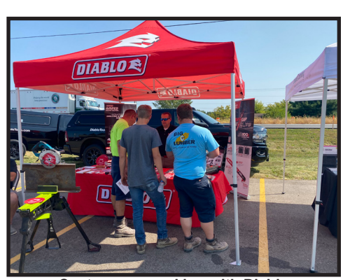
Customers speaking with Diablo representative at Schoolcraft

For our valued customers, we held two events: our Schoolcraft event was on September 12th and our Shipshewana event on September 18th. These events are exciting for us because we have the opportunity to see more of our customers at once and they get to speak with representatives of the products they purchase. Vendors include Lumbermen's, Palmer Donavin, Diablo, Milwaukee, Wincore, and many more. We would like to thank everyone involved for taking the time to make this event happen.