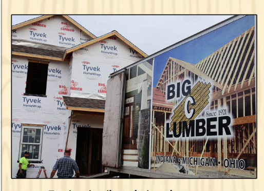
Truck unloading windows into a new construction house.