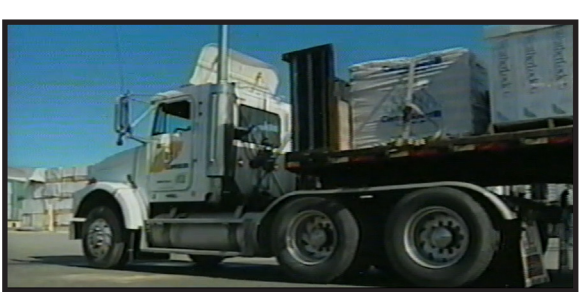
Screenshot from commercial shot in 2005

"THINK BIG, BIG C!!!!" is something many remember hearing from our old TV commercials. When we first started airing them in 1987, the music that accompanied had a more "twangy" country sound. To broaden our appeal to customers, we started creating a new jingle with the help of an outside agency in late 2001. This is also around the same time we adopted the motto "Hometown Service, Hometown Pride!" that you see on the first page of The Big Scene and is also in the jingle. While we haven't used this jingle for some time, it is still a defining trait of Big C that many of our customers and employees still sing to this day.